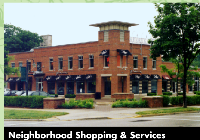
E Neighborhood Shopping & Services