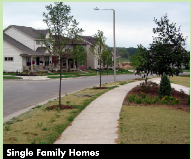
A Single Family Homes