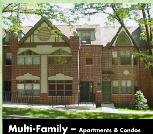
D Multi-Family – Apartments & Condos